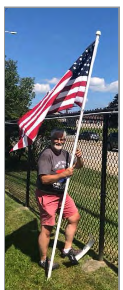
On June 24, members of the Rotay Club of Waynesburg were hard at work setting up for the annual Flags for Heroes! Thanks to the hard work by these club members, American flags will be on display at the Greene County Fairgrounds through Independence Day!