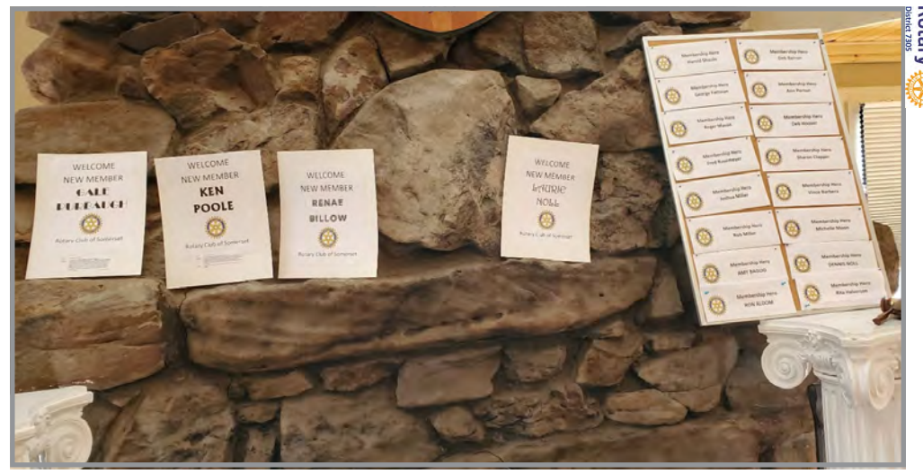
The Rotary Club of Somerset displayed a "Membership Heroes Board" and the names of new members to inspire their membership to propose new members. The result was a net growth, even as the club, like all of us, faced the challenges of COVID-19.

This club and their dynamic team decided to do what they had been doing in the past, but added to it. They attended the Membership Summit offered this year through District 7305 and Zone 33/34. They then employed all the tools that had been presented. They comprised a series of initiatives designed to enhance membership. They began with a simple "ask" program where they challenged members to bring their personal contact lists to a meeting. At the meeting, they distributed cards asking members to provide the names of people they thought would make good Rotarians. The names submitted served as an initial prospect list. Taking it one step further, they created a "Membership Heroes Board," recognizing those members who provided names for the prospect list. They prominently